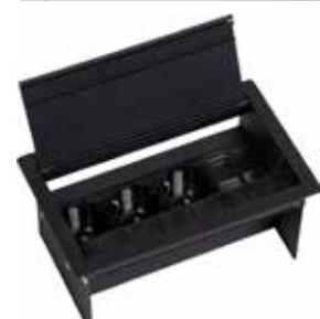
VEGA Product Cover Is Opened Manually Socket System

When the cover is opened, the sockets are under the cover, ready to use. It is durable and long-lasting with the materials used. It is possible to work closed with its brush feature.