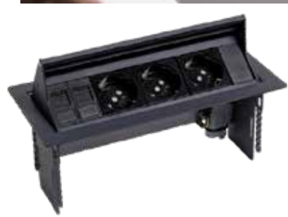
AGENA Pop-Up Push-To-Open Socket System

It provides easy use with its press-open mechanism. When the cover is opened, the sockets appear together with the cover. It is durable and long-lasting with the materials used.