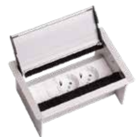
CAPELLA MINI Two-Way Opening Cover System

It is now easy to access sockets on large meeting tables with the twoway-opening cover design. When the cover is opened, The sockets are under the cover, ready to use. It is durable and long-lasting with the materials used. It is possible to work closed with its brush feature.