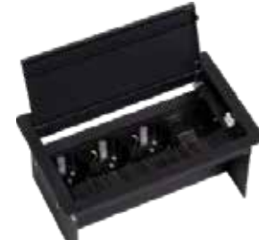
VEGA It Provides Easy Use With Its Press-Open Mechanism.

When the mechanism is opened, the sockets are under the cover, ready to use. It is durable and long-lasting with the materials used. It is possible to work closed with its brush feature.